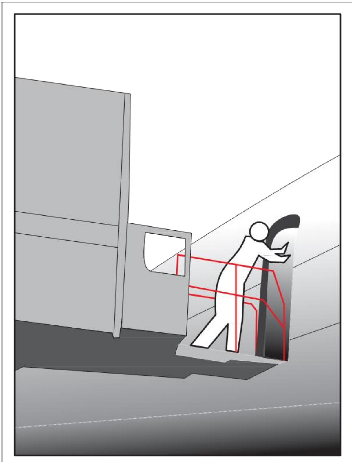
Figure 2 Inward Opening Aircraft Door

8.2.4 Where the aircraft has outwards opening doors, which may foul the access equipment during opening and closing, employers should establish whether the safest option, for both the worker and the aircraft, is to open the door from