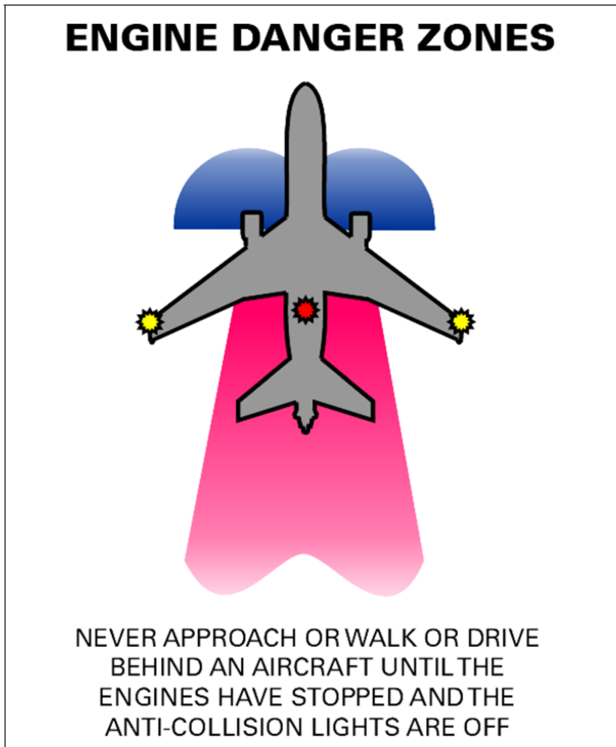
Figure 1 Engine Danger Zone

7.23 Personnel entering the danger zone in front of a running jet engine expose themselves to the risk of being sucked in, almost invariably resulting in serious or fatal injury.