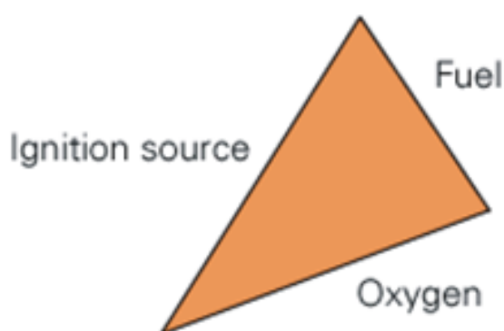
Figure 4 The Fire Triangle

13.3.3 Where the substance cannot be eliminated, or substituted, then appropriate precautions need to be in place. Control of the risks of flammable substances can be considered in terms of removing at least one side of the 'Fire Triangle'. See Figure 4.